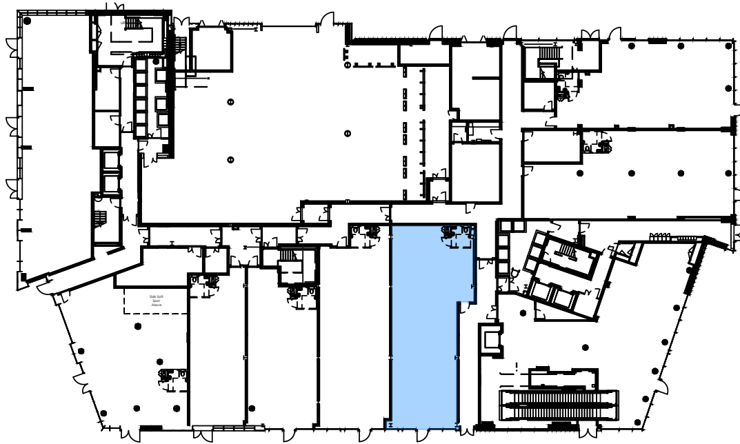
BUILDING PLAN SCALE 1:500@A4