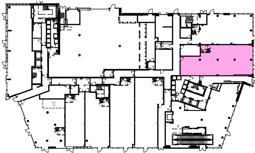
BUILDING PLAN SCALE 1:500@A4